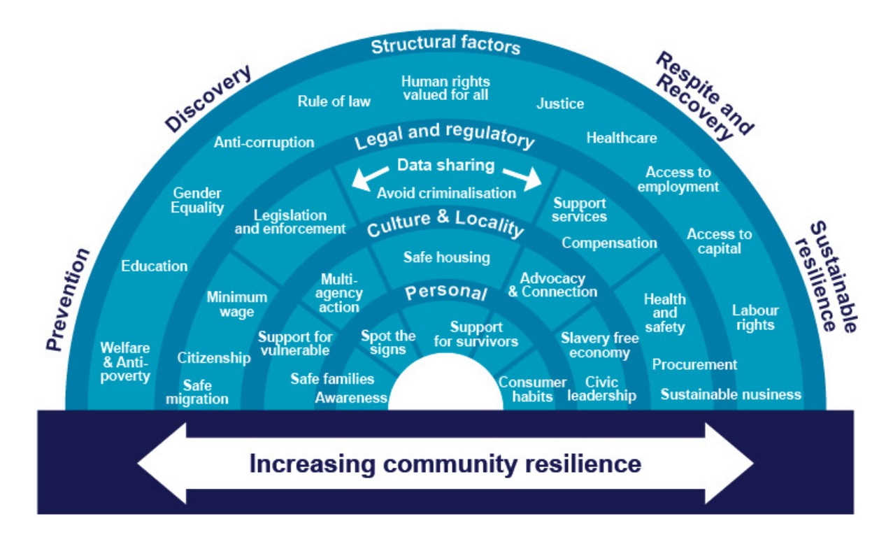
Figure 1: Social determinants of community resilience against exploitation

Building community resilience is also a process, which involves a continuous cycle of problem-diagnosis, developing coalitions to drive change, addressing social, cultural and institutional barriers and consolidating changes through adjustments to policy and legislation. This process must be embedded in communities as well as driven by governments, NGOs and the private sector (see figure 2.)