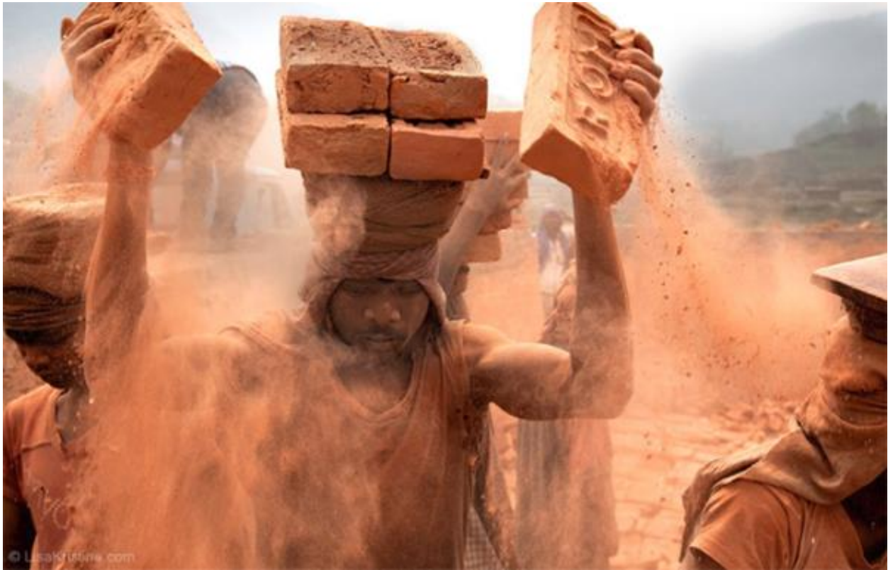
Brick kiln slavery in Asia

We stand before an image of a slave, struck by the pain but also the power. Her work evokes a lingering disquiet over the state of modern slavery but is also a motivator to do something about it.