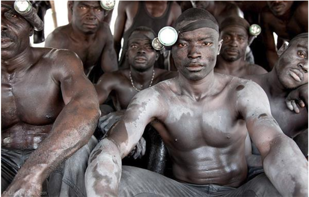
Gold mining slavery in Africa